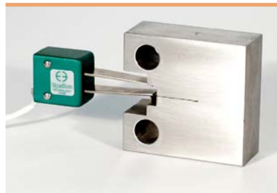
Model 3541 COD gage

For fracture mechanics studies, these COD gages are in compliance with standardized test methods, such as ASTM E1820 for determination of fracture toughness properties of metallic materials.