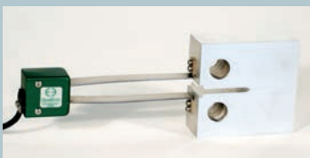
Model 3541-012M-120M with 12 mm gauge length and +12 mm measuring range