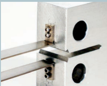
Model 3541 attached to bolt-on knife edges

See the electronics section of this catalog for available signal conditioners and strain meters.