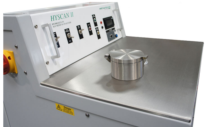
Hyscan II, used in production foundries worldwide, provides analysis within 5 minutes of sampling

Substantial improvements in the quality and reliability of aluminium alloy castings can be achieved if the hydrogen content of the melt is controlled. Aluminium alloys absorb hydrogen in the liquid state and unless it is removed, porosity will occur in the casting. Accordingly, an accurate measurement of hydrogen in the melt before casting is essential to ensure that degassing operations achieve the specified quality acceptance value.