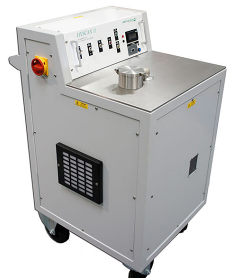
Hyscan II is UK designed, manufactured and supported

Australia, Brazil, Bulgaria, Canada, China, Eire, Finland, France, Germany, Greece, Holland, Hungary, India, Indonesia , Italy, Japan, Korea, New Zealand, Norway, Oman, Romania, Singapore, South Africa, Sweden, Thailand, Turkey, United Kingdom, United States, Venezuela