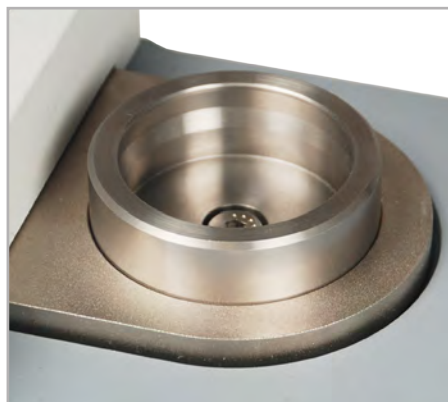
WT3003 Machinable blank terminal fixture For unique sample shapes and sizes.