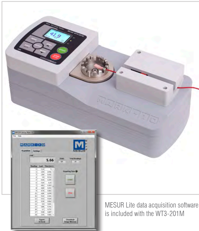
MESUR Lite data acquisition software is included with the WT3-201M

The WT3-201M motorized wire crimp pull tester is designed to measure pull-off forces of up to 200 lbF [1 kN] for wire and tube terminations. The tester conforms to numerous UL, ISO, ASTM, SAE, MIL, and other requirements for destructive testing. Non-destructive testing is also possible, such as pulling to a load or maintaining a load for a specified period of time, as per the requirements of UL 486A/B. Programmable pass/fail limits with red and green indicators and audio alerts help identify non-conforming samples.