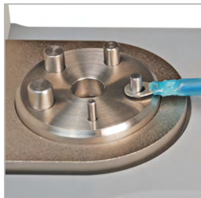
WT3002 Ring terminal fixture Secures ring terminations. Pin diameters from 1/8 to 3/8 in [3.2 to 9.5 mm].