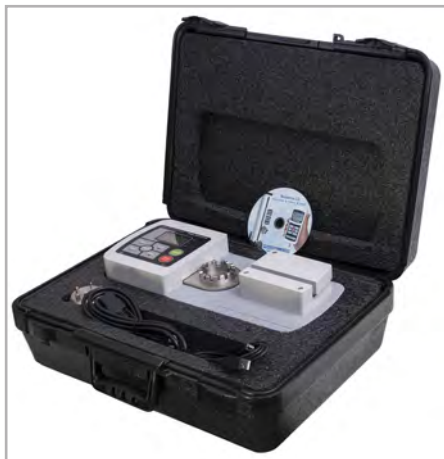
WT3004 Carrying case Provides storage space for the WT3-201M tester, optional ring terminal fixture, power cord, USB cable, and accessories.