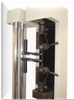
High Elongation Extensometer